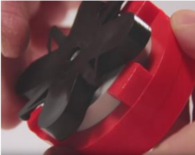
Die # 1